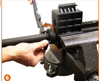
Clamp the upper receiver on a vise with an AR15 upper receiver vise block. Loosen the barrel nut by turning it counterclockwise with an AR15 barrel nut wrench. Take out the original barrel nut with the delta ring assembly.