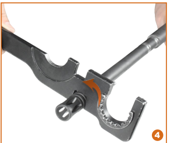
Remove the Flash Hider by turning it counterclockwise with an AR15 combo wrench