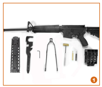
Prepare the rifle, the mount and necessary tools (a hummer, a punch, an AR15 upper receiver vise block, an AR15 handguard removal tool, an AR15 combo wrench and a vise). Set up a comfortable working environment