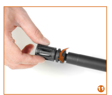
Install the Flash Hider on the Barrel.