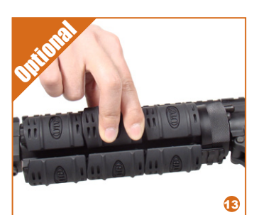
(Optional Step) - Install the Rubber Rail Guards if desired. Simply extend the Rubber Rail Guard accessories on the free floating quad rails, to horizontally cover the rail. Press the whole piece to clip onto the rail along 2 sides for a tight fit.