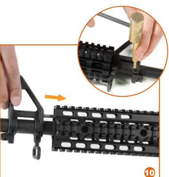
Put back the Front Sight with the Gas Tube. Put back the two pins to lock the Front Sight to the barrel.