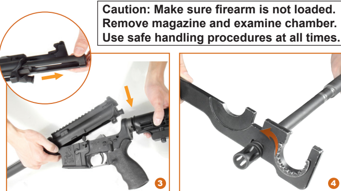
Remove the lower receiver with stock assembly. Take out the bolt assembly.