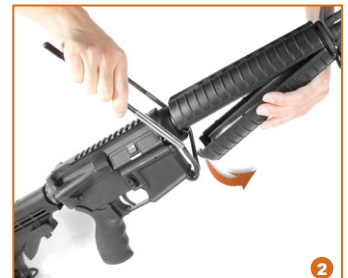
Remove the original plastic handquard with a handguard removal tool.