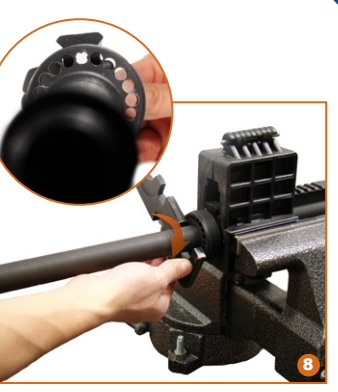
Fit the free floating barrel nut on the upper receiver, and tighten it with enough tension. Make sure that one of the through holes on the barrel nut is aligned well with the hole on the upper receiver for the gas tube to pass.