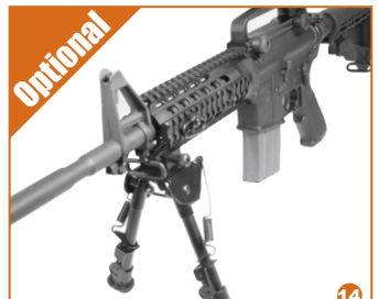
(Optional Step) - Install high quality UTG such as foregrip, bipod, flashlight, laser, dot sight, etc. Your rifle is ready for test firing now.