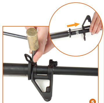
Place the barrel on a well padded flat surface securely. Punch the two pins at the bottom of the front sight out with a hummer and a punch. Remove the Front Sight with the Gas Tube, and take out the Front Cap.