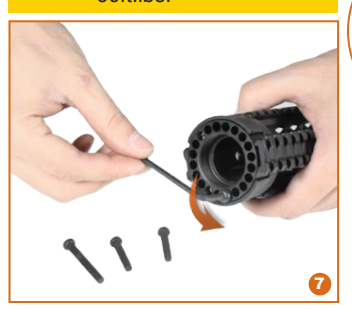
Release the 4 locking screws by turning them counterclockwise with the included Allen wrench, and take out the free floating barrel nut from the handguard assembly.

Max. torque value for installing barrel nut should not exceed 60ft.lbs.