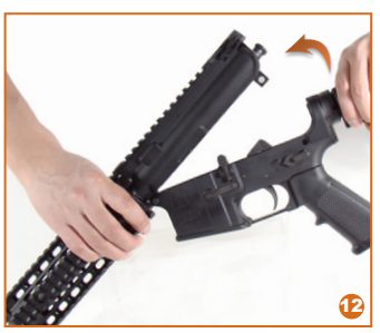
Put back the bolt assembly, the lower receiver and the stock assembly.