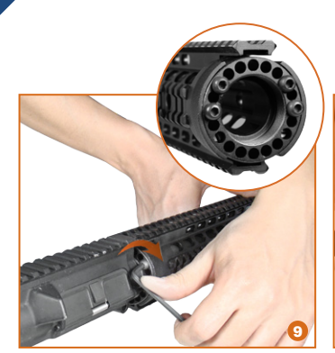
Fit the free floating handguard mount onto the barrel nut, and make sure that the top rail of the mount is aligned well with the flat top and that the two alignment pins go into the through holes on the barrel nut. Tighten the 4 locking screws into the handguard assembly with about 35 inch-lb torque.